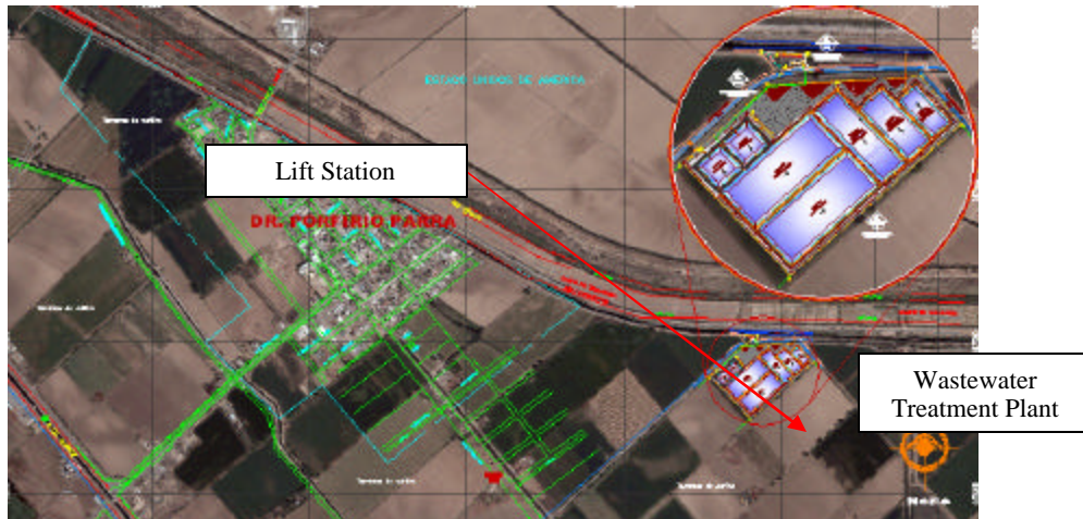
Figure 3. Project Components

Figure 3 shows the location of the proposed wastewater treatment plant and lift station with pretreatment.